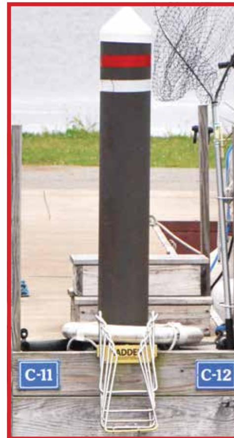
Emergency Ladder & reflective piling tape.

In the event that the pull box is activated, a local alarm will sound along with a strobe light at the pedestal, a call to the EYC security company will occur with box specific coordinates, and it will automatically open the gates for emergency responders to quickly access the property. The five boxes are located at A-13, B-02, H-12, L-25, and at the start of N-Dock. Learning the dock layout of the basin is a great way to get to know your Club a little better and a simple guide for directing people to specific locations.