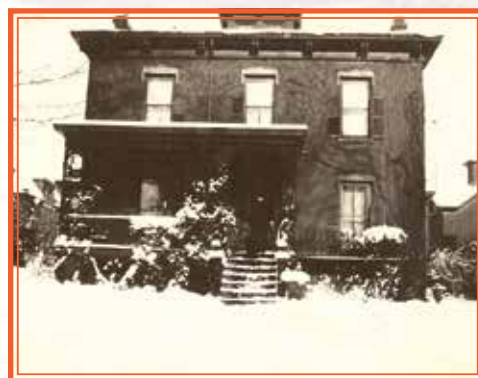
Wood-Morrison home circa 1934.