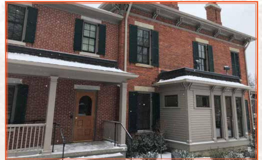
Westside view of the restored Wood-Morrison house.

The home's second floor bedrooms now include state of the art education and classroom space for lectures, and the basement, with its exposed bluestone foundation, which once served as Dr. Wood's medical office, will now provide additional space.