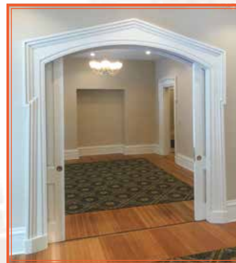
Interior of the restored Wood-Morrison house.