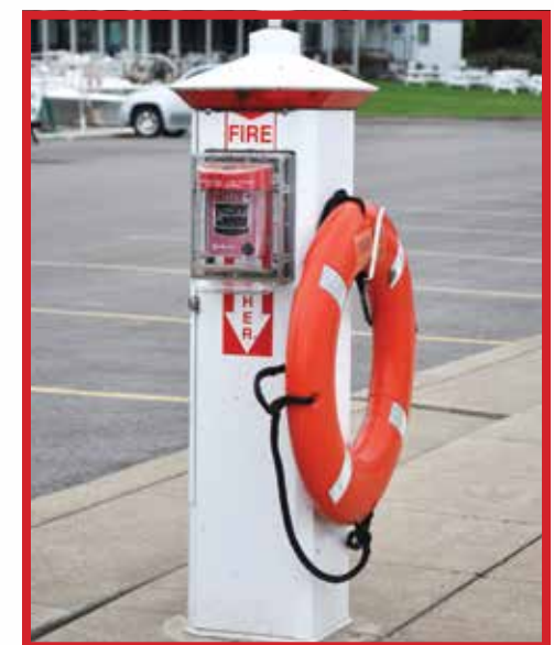
Fire Pedestal pull box at H-12.

A recent major achievement for the member safety committee was a shore power cord audit. This entailed a basin wide inspection of ship to shore power cords being used on the docks; confirming that the correct cords and receptacles were being used.