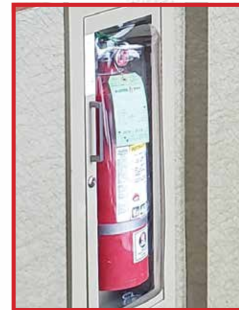
One of ten fire extinguishers in the Clubhouse.

New and improved signage has also been implemented around the Club property. Areas such as the "recyclable area" across from the Locker House, and around the Club's natural gas well, the fuel dock, and down in the basement of the clubhouse. These signs are informative, easy to see, and make people aware of their surroundings.