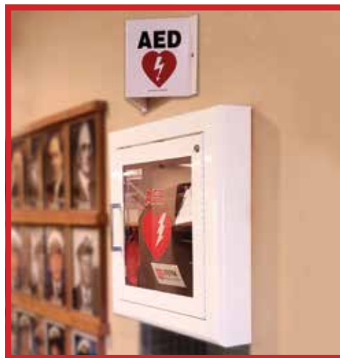
AED in the Clubhouse hallway.

Let's start our tour in the clubhouse. As you're walking the halls or relaxing in the grill room, I encourage you to just take a closer look around. You'll start to notice that the fire extinguisher locations are all labeled with signs and decals, you'll see numerous brightly lit exit signs along the way with strategically placed emergency lighting, and we even have an automated external defibrillator (AED) located in the hallway above the water fountain.