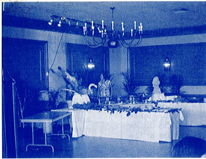
You bite me, bird, and I'll bite you back!