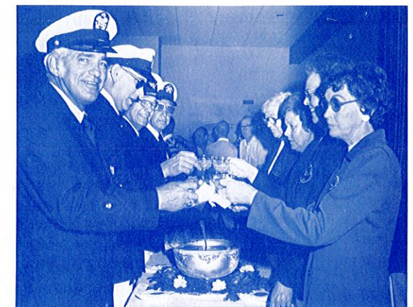
Officers being served first punch by their "better halves".