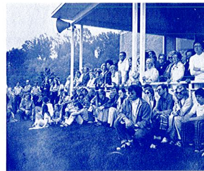
Candid scenes from Memorial Day Ceremonies.