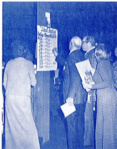
Checking the tally on the "Silent Auction" board during the Sale.