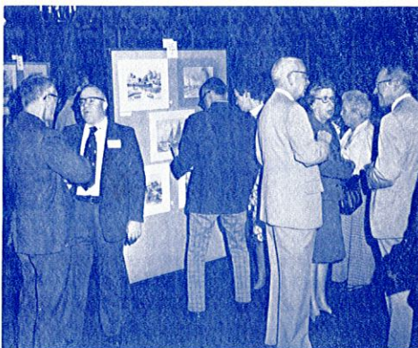
Various members viewing "Skipper's" many lovely paintings before the sale.