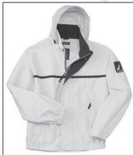
Nautica® Chest Stripe Jacket

Price applies to sizes XS-XL $89.95 $6.00 for each additional X-size