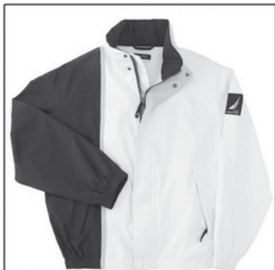
Nautica® Vertical Block Jacket

A signature style, this vertical color-blocked jacket is instantly recognizable, with contrasting collar and front placket facing. Made of 70/30 cotton nylon, the features include a hidden hood with Velcro closure, storm flap for added protection, storm pockets with zip closures, elasticized cuffs and hem, mesh lining, lined sleeves and back locker loop.