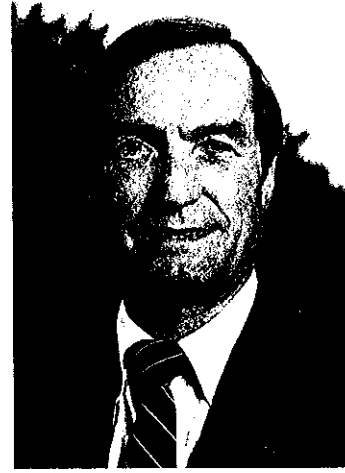
CANDIDATE FOR FLEET CAPTAIN

The final reason I ask for your support on election day is simply because "I love the place".